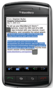
Selecting text to cut or copy

To select text to cut or copy, simultaneously touch the screen before and after the text that you want to cut or copy. To move the cursor one character at a time, touch the cursor frame and slide your finger.