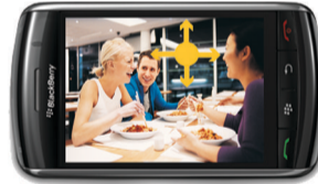
Panning a picture

To pan a picture, slide your finger in any direction.