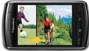
Moving between items

To move to the previous item, slide your finger to the right quickly.